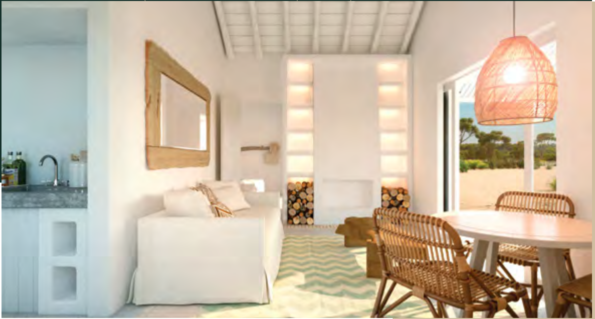
13 SUITE B